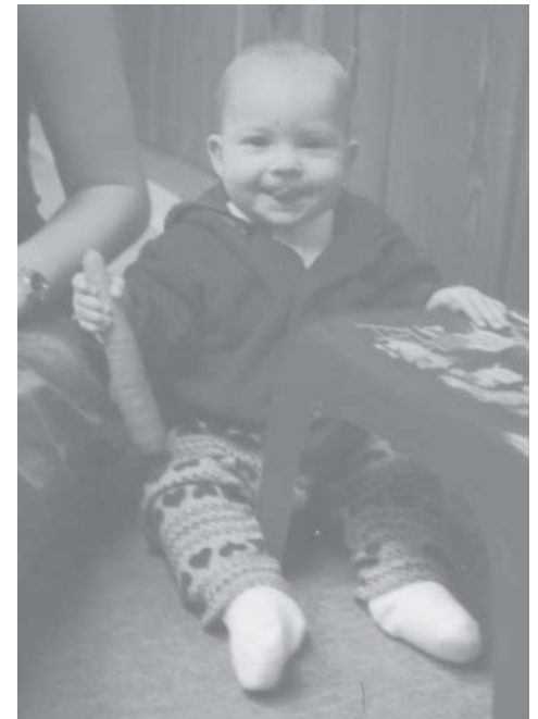
A satisfied customer of the Nelson Good Food Box enjoys an organic carrot from Spicer Farm

The Network advocates a food policy which places community food security as the highest priority.